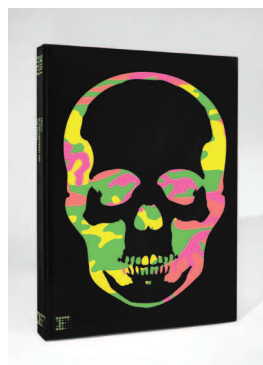
Neon Camouflage Cover ISBN: 978-0-9830-8313-9