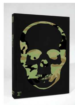
Camouflage Cover ISBN 978-0-9830-8316-0